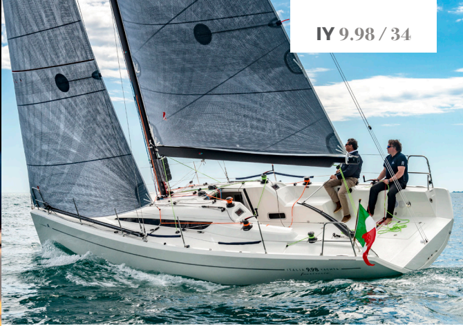
IY 9.98 / 34