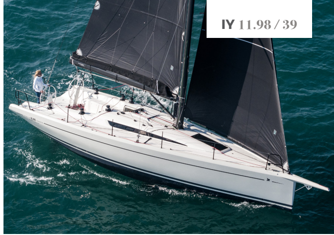
IY 11.98 / 39