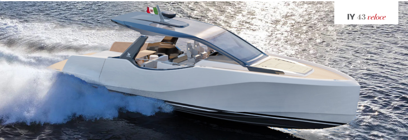
IY 43 veloce