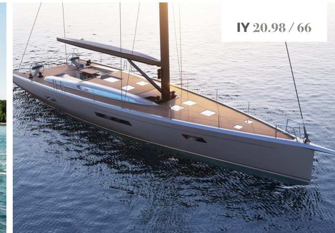
IY 20.98 / 66