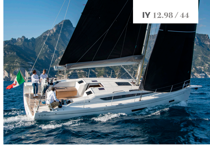
IY 12.98 / 44