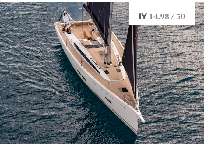
IY 14.98 / 50