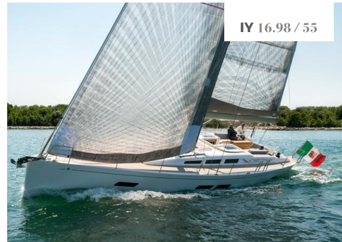
IY 16.98 / 55